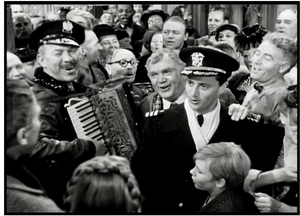
Frank Capra entertaining with his accordion on the movie set of "You Can't Take It With You".

The star of this movie, Jimmy Stewart, has always been my favorite actor. Wholesome and warmly "real," Stewart could so convincingly bring his characters to life. It's a Wonderful Life, produced and directed by Frank Capra in 1946, was one of three Capra films that starred Jimmy Stewart. Capra felt that Stewart was perfect to project a message of an ideal America. The two men became close friends. I soon discovered that they had something else in common: they both played and loved the accordion.