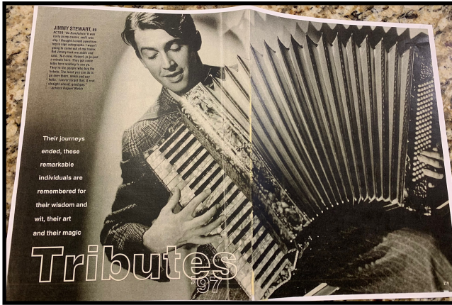
Two-page spread in the Washington Post Magazine when Jimmy Stewart died in 1997. Photo from 1938.

It is the time of year, once again, when my mind goes to holiday music, magical light displays, celebrations with loved ones, and to my all-time favorite movie, "It's a Wonderful Life." I have watched this heartwarming movie every Christmas season for the last 50 years. The message conveyed in this film is one that each of us should hear often: None of us is a failure if we have helped others, even in a small way.