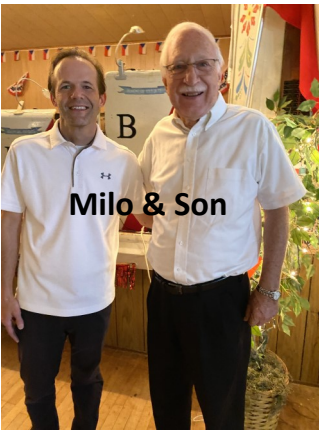
Milo & Son