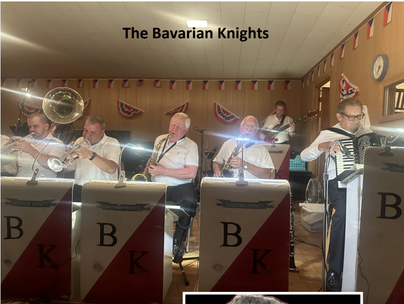
The Bavarian Knights