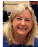
OAC Meetup July 14, 2024