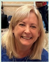
OAC Meetup Feb. 9, 2025