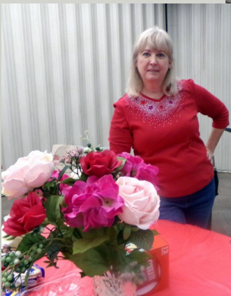
OAC Meetup Feb. 9, 2025